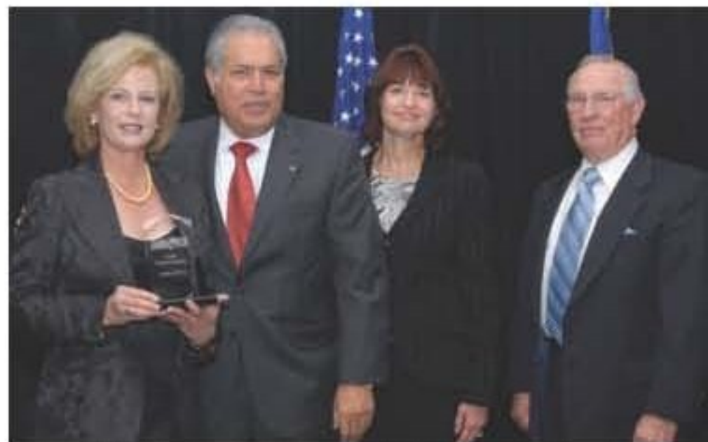
First Lady of Texas, Anita Perry, spoke about Character in our country at the 2008 Learning for Life Character Luncheon.

Circle Ten Council lead the nation in popcorn sales by increasing sales by 7.1 percent in 2008. Sales of more than $4.34 million help support Circle Ten Council's operations and also help packs, troops and crews pay for camp and other activities. Thanks to continued marketing efforts and improved incentive and training programs, more than $1.6 million went directly to Scouting units throughout the 12-county Circle Ten Council service area.