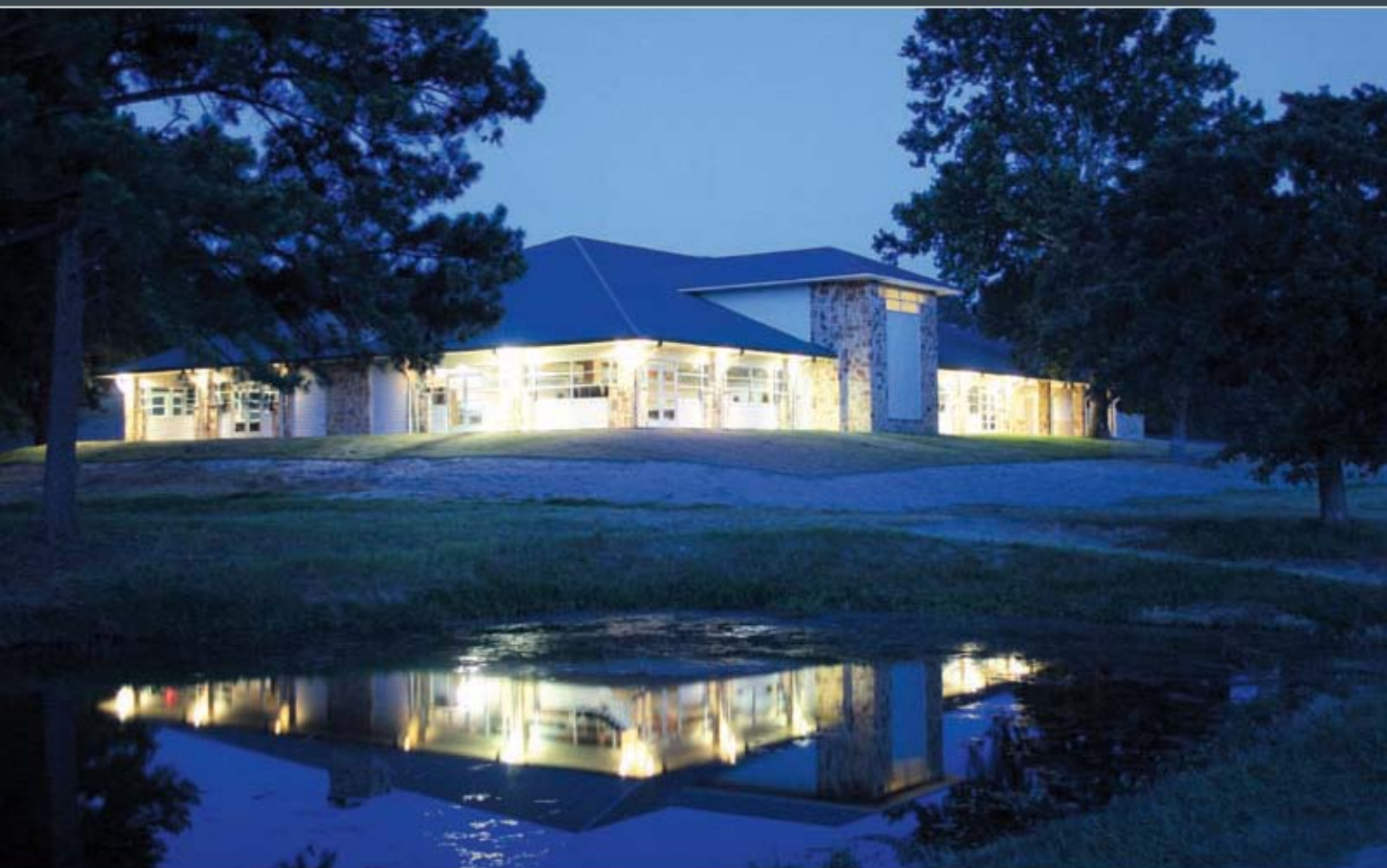
In 2008, Circle Ten Council opened the 13,000 sq. foot Jim Tarr Dining Hall at Clements Scout Ranch.

CELEBRATING THE ADVENTURE ★ CONTINUING THE JOURNEY